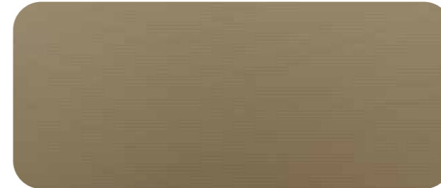
AL001 - Anodized Look C2 Light Gold