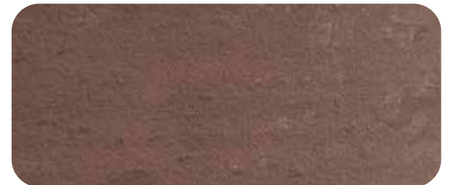
CL008 - Stonehenge