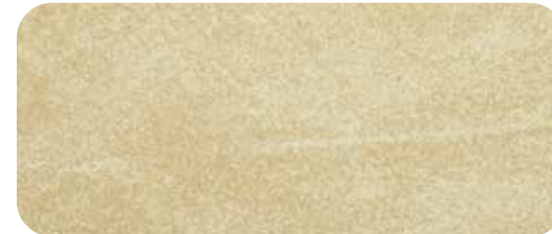
CL005 - Concrete V