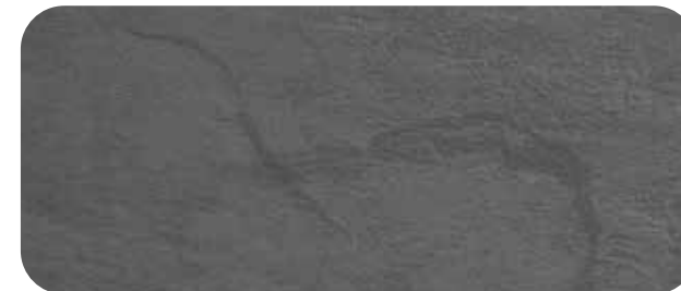
CL007 - Stonehenge