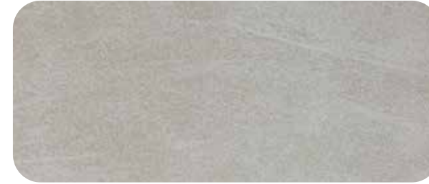
CL001 - Concrete I

Urban Line: The Urban Line family entirely captures the essence of patterns formed by concrete. Albond's panels in this collection mirror the urban landscape, offering a contemporary and industrial aesthetic. Ideal for those seeking a modern and bold statement for their spaces.