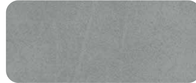
CL003 - Concrete III