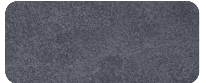
CL006 - Anthracite Concrete